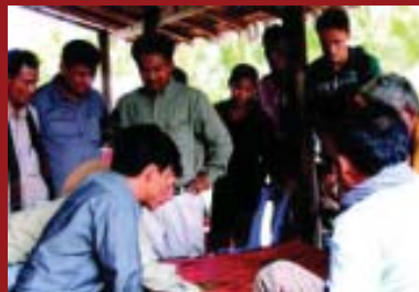
A meeting of Cambodia Ministry of Land Management, Urban Planning and Construction staff, local authorities, and villagers was held at a proposed site for a social land concession pilot program under the ADB-financed Land Law Implementation Project.

The majority of land in Cambodia is unregistered, resulting in uncertainty and confusion regarding land ownership and land rights. Through two consecutive projects, ADB is helping the Government of Cambodia establish landownership and related landrights laws to help resolve these issues. ADB has assisted in developing a legal framework for establishing cadastral commissions, which are administrative bodies responsible for hearing land disputes about unregistered land at the district, provincial, and national levels. The ADB support included training for commissioners in dispute resolution; in 2002–2003 the commissions considered 979 cases of which 226 have been resolved. Before the establishment of these commissions, all disputes over Cambodian land, whether registered or not, went directly before the courts.