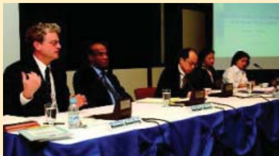
A seminar on Anti-Money Laundering and Combating the Financing of Terrorism in Manila, Philippines, March 2003

In each of the nine DMCs, research was undertaken to assess the challenges facing each country in complying with internationally accepted standards for anti-money laundering, and to suggest necessary reforms. This research led to ADB's further involvement in anti-money laundering by providing country dialogue, technical assistance projects and loan components in these and other DMCs, including Cambodia, PRC, Indonesia, Lao PDR, Philippines, Samoa, Vanuatu, Viet Nam, and Central Asian republics. The assistance aims to help DMCs meet the international standards on anti-money laundering, thereby establishing a robust legal and institutional framework that protects financial institutions from criminal misuse and ensures their integrity.